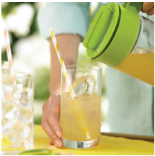
Twist to pour, align arrows on lid with pour spout