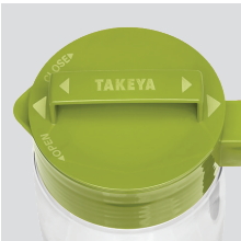
Drinks stay fresh with the airtight lid