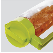
Leakproof, airtight lid, stores upright or on its side