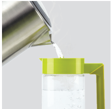
Withstands boiling hot water (212°F) and ice cold temperatures