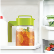
Stores in fridge door