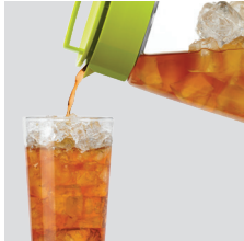
Makes fresh iced tea in minutes