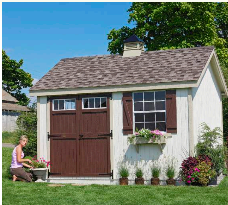
Colonial Pinehurst Garden Shed

Picture Shown With Optional Transom Windows & Cupola