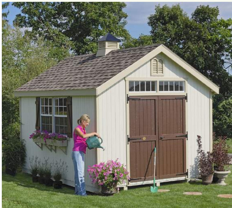
Colonial Williamsburg Garden Shed

Picture Shown With Optional Transom Windows & Cupola