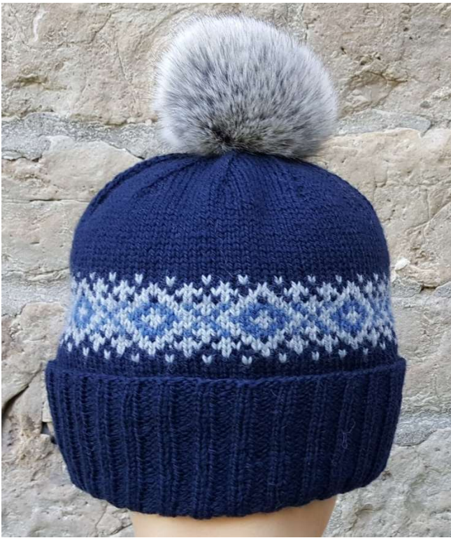
Shown in 8393 Navy, 8401 Silver Gray, and 9326 Colonial Blue Heather

Once round 13 is completed, switch back to 3.5mm (US4) needles, and K 16 rounds with just MC.