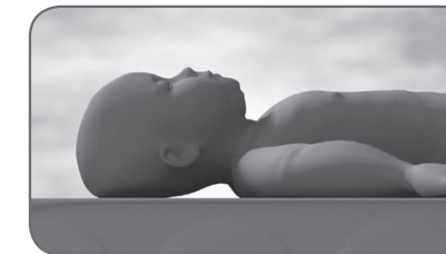
Flat Head on a Standard firm mattress