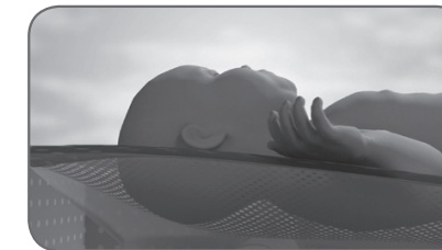
Normal head on a LifeNest