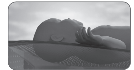
Normal head on a LifeNest