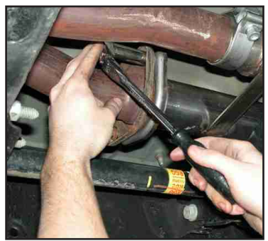
FIG. L INS5021 7/8/09