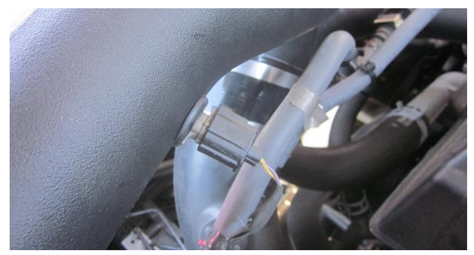
16. Clip wiring harness on air temperature sensor.

13. Install air duct into vehicle by placing the hump hose onto the filter adapter, then place reducer onto the upper stock inlet. Rotate duct down and into the straight sleeve.