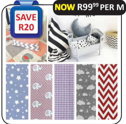
PRINTED PERA 100% KIDDIES COTTON (235CM) WAS R119 99 PER M