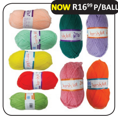
ELLE FAMILY KNIT 4PLY, DK & CHUNKY 50G