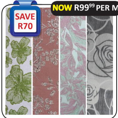
IMPORTED DENIM (150CM)