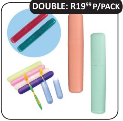
TOOTHBRUSH HOLDERS SINGLE: R14 99 EACH