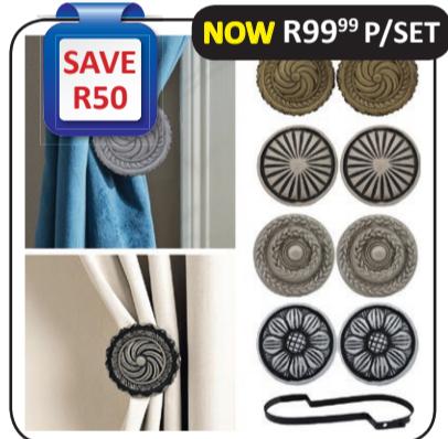
CURTAIN HOLD BACK WAS R149 99 PER SET