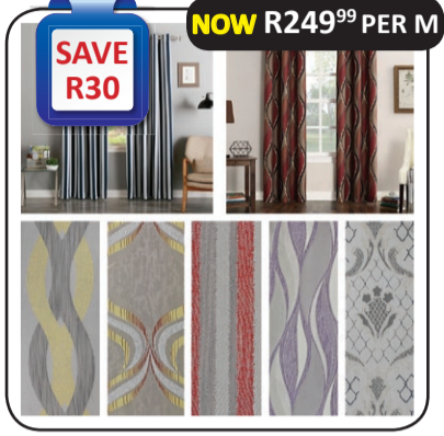
TURKISH CURTAINING (280CM) WAS R279 99 PER M