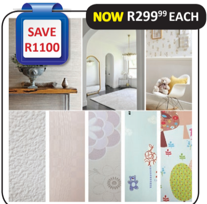
WALLPAPER (15.6MX106CM) WAS R1399 99