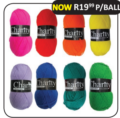
CHARITY DK 100G WAS R22 99 P/BALL