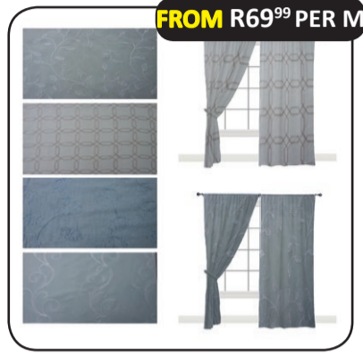
EMBROIDERED LINEN VOILE (280CM)