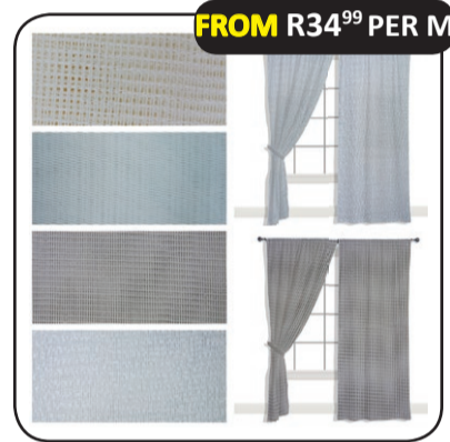
JAVA LACE & JAVA MAT (280CM)