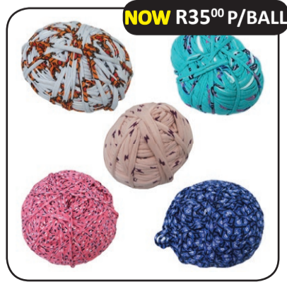
T-SHIRTING YARN +500G ASSORTED COLOURS

WE RESERVE THE RIGHT TO LIMIT QUANTITIES - SALE WHILE STOCKS LAST - PRICES VALID FROM THE 24 SEPTEMBER TILL 20 OCTOBER 2018 - IMAGES USED FOR ILLUSTRATION PURPOSES