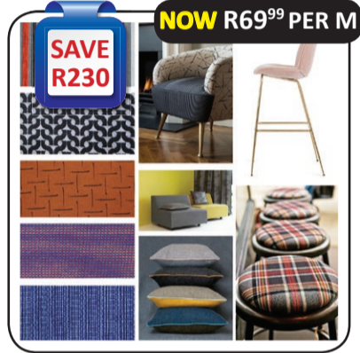
PLAIN UPHOLSTERY IMPORTED FROM U&G FABRICS WAS R299 99 PER M