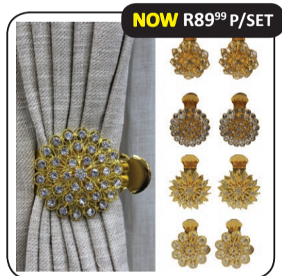
HOLD BACK CLIPS

CURTAINING SAVE UP TO R300 PER M ON NETTEX CURTAINING