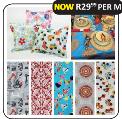
PRINTED MINI MATT (150CM)