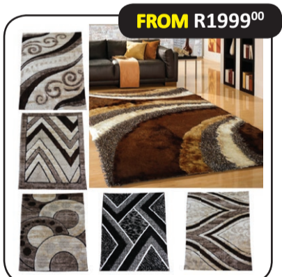
SHAGGY CARPET COLLECTION (200X290)