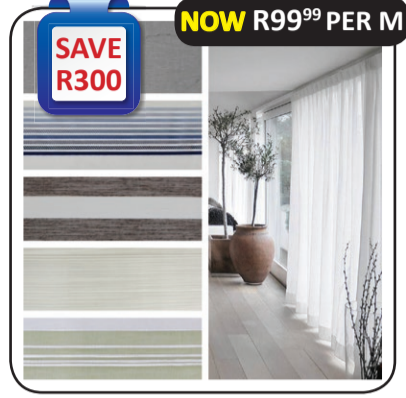
PRINTED ORGANZA (280CM) IMPORTED FROM NETTEX WAS R399 99 PER M