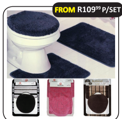
3PC SANDY TOILET SET (50X80)