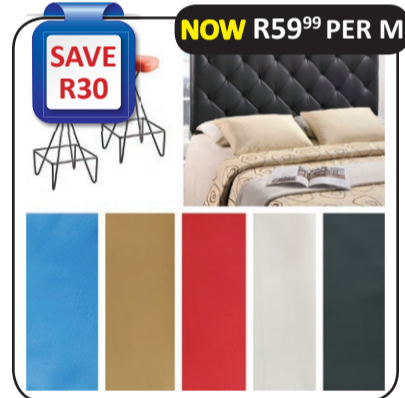
ANTI TEAR PLAIN VINYL (140CM) WAS R89 99 PER M