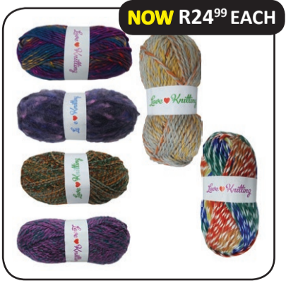
MIXED SPECIAL YARNS 100G IMPORTED FROM TURKEY ~NEVER TO BE REPEATED~