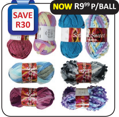
FISH-NET YARN 100G WAS R39 99 P/BALL