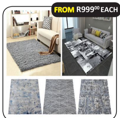
ELEGANCE CARPET COLLECTION (120X170)