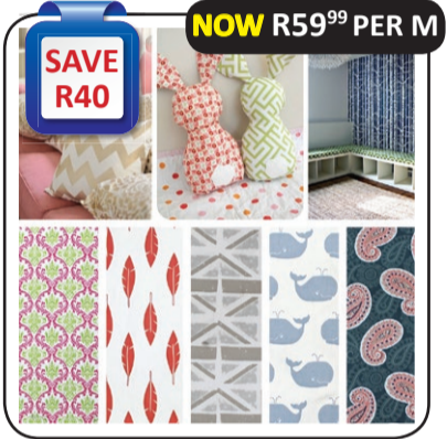
PRINTED COTTON CANVAS & PRINTED LINEN (150CM) WAS R99 99 PER M