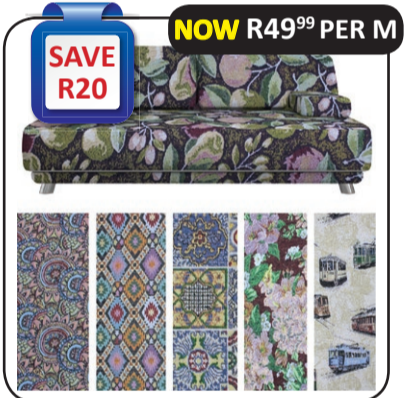
PRINTED TAPESTRY (140CM) WAS R69 99 PER M

CURTAINING SAVE UP TO R300 PER M ON NETTEX CURTAINING