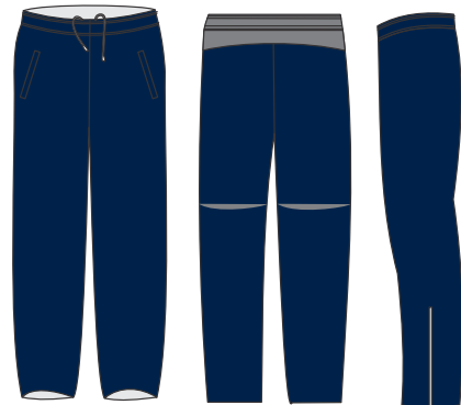
TRACK SUIT PANT VPSF010

220gsm Tricot Knit fabric 200gsm Micro Mesh Panels Internal elastic waistband and drawcord for a customised fit, available in regular or slim fit. Featuring two side pockets and mesh panel for moisture management at the rear. Sublimation or cut n sew options available.