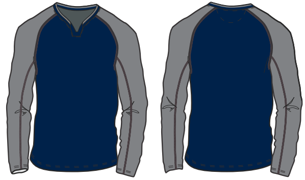
LONG SLEEVE SHOOTER SHIRT VPVL005

Shirts combine targeted heat zones with hi-tech moisture management fabric maximising heat dissipation, keeping you cool. Each garment features mesh sleeves, 2cm high side splits, curved hem and contrast cuff and neck tabs.. Attributes include breathability, moisture wicking and cooling properties.