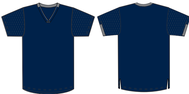
SHORT SLEEVE SHOOTER SHIRT VPV005

Shirts combine targeted heat zones with hi-tech moisture management fabric maximising heat dissipation, keeping you cool. Each garment features mesh sleeves, 2cm high side splits, curved hem and contrast cuff and neck tabs.. Attributes include breathability, moisture wicking and cooling properties.