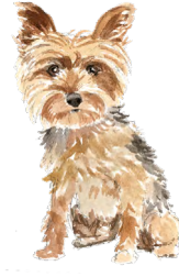
HP86 YORKSHIRE TERRIER