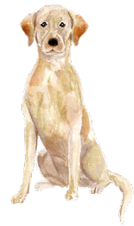
HP58 LABRADOR RETRIEVER