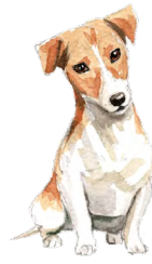
HP51 JACK RUSSELL