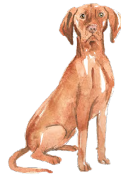
HP48 HUNGARIAN VIZSLA