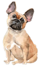
HP41 FRENCH BULLDOG