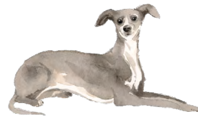
HP50 ITALIAN GREYHOUND