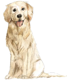
HP45 GOLDEN RETRIEVER