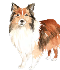
HP75 SHETLAND SHEEPDOG