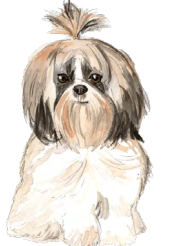
HP76 SHIH TZU