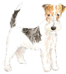
HP42 FOX TERRIER