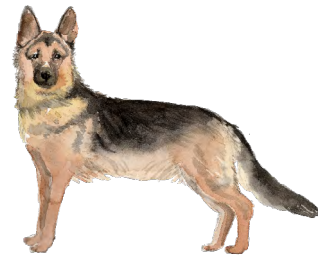
HP43 GERMAN SHEPHERD