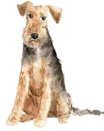
HP83 WELSH TERRIER