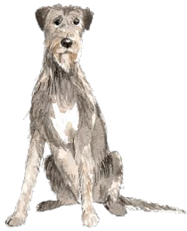
HP49 IRISH WOLF HOUND