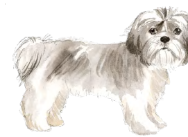
HP77 SHIH TZU