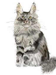
HP95 MAINE COON