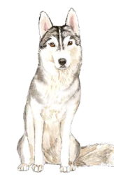
HP78 SIBERIAN HUSKY