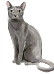
HP91 BLUE RUSSIAN