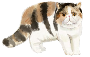
HP94 EXOTIC SHORHAIR