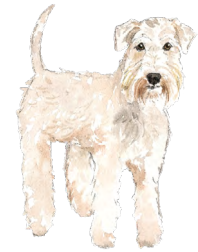
HP85 WHEATEN TERRIER