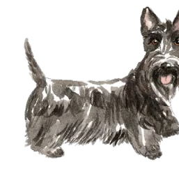
HP74 SCOTTISH TERRIER