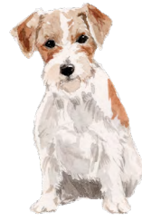
HP52 JACK RUSSELL