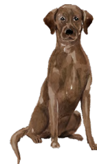
HP55 LABRADOR RETRIEVER