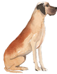
HP46 GREAT DANE