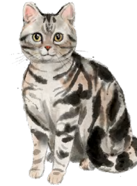
HP88 AMERICAN SHORHAIR