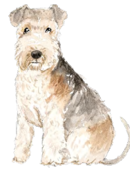
HP59 LAKELAND TERRIER