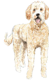
HP44 GOLDEN DOODLE