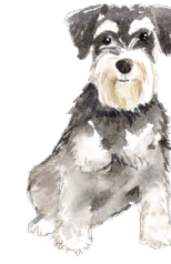
HP62 MINIATURE SCHNAUZER