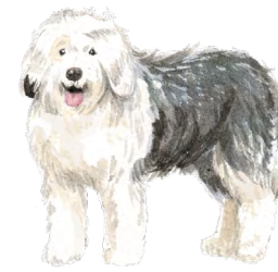
HP65 OLD ENGLISH SHEEPDOG