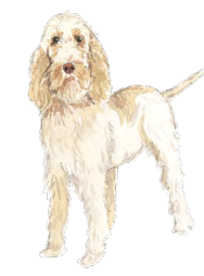
HP79 SPINONE ITALIANO