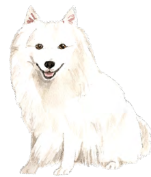
HP53 JAPANESE SPITZ