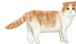
HP99 SCOTTISH FOLD