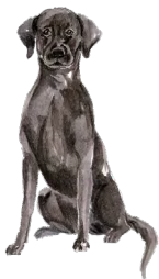
HP57 LABRADOR RETRIEVER