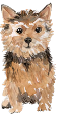
HP64 NORFOLK TERRIER