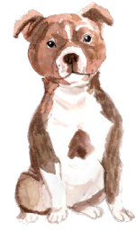
HP81 STAFFORDSHIRE BULL TERRIER