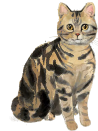
HP89 AMERICAN SHORHAIR