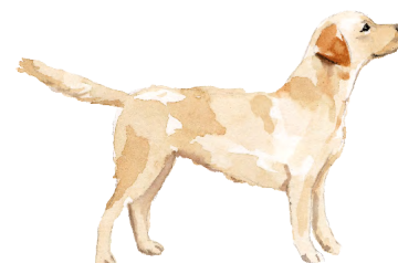
HP56 LABRADOR RETRIEVER