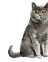
HP93 BRITISH SHORHAIR