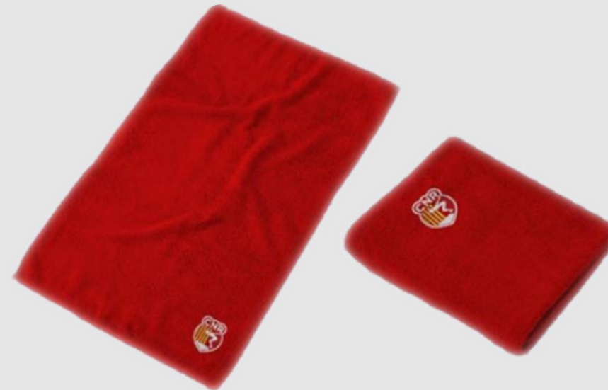
Embroidered Bath Towel