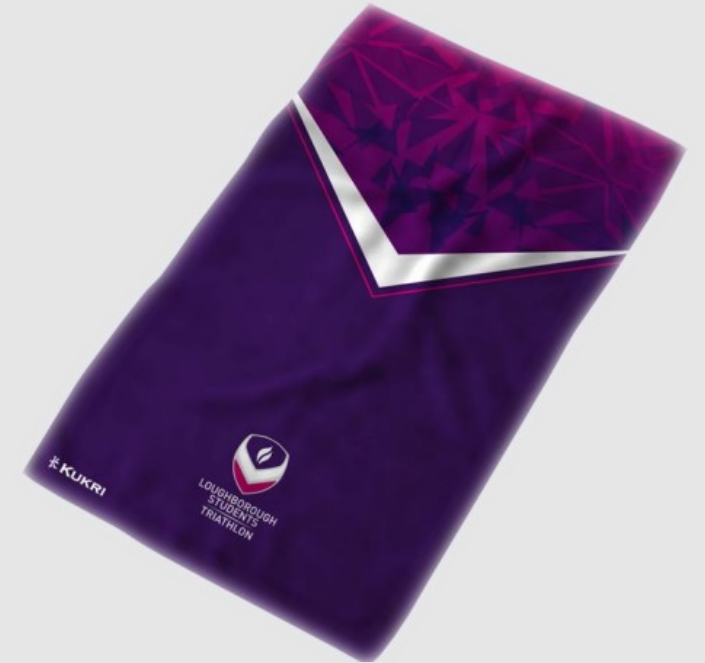
Fully Sublimated Microfibre Towel