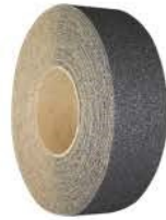
STANDARD 19- BLACK

With 4 distinct blacks and 12 assorted colors (including glow-in-the-dark), customizing to your exact needs is simple. The full line of Master Stop tapes is available for inlay—providing a variety of colors, grit materials and custom capabilities.