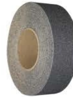
02- SC BLACK