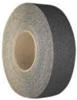
14- HD BLACK