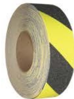
17- BLK/YL HAZARD