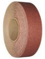
04- BRICK RED