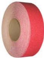
15- SAFETY RED