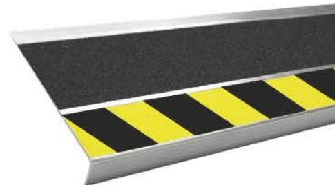
Shown in 19-BLACK and 17-BLK/YL HAZARD

MASTER STOP™ Aluminum Tape Treads are heat treated extruded 6063 T5 exterior grade aluminum inlaid with Master Stop mineral abrasive grit-coated polyester film.