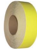
08- SAFETY YELLOW