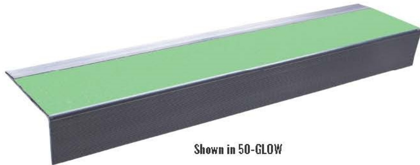
Shown in 50-GLOW

Master Stop® Tape Treads are an eye catching, resilient, high quality aluminum extrusion that is inlayed with any of our anti-slip tape colors. These treads are used on renovation projects to deliver maximum safety and durability while providing a look that compliments todays building designs. Master Stop® Tape Treads are created using heat treated, exterior grade 6063 T5 aluminum, inlayed with any of our anti-slip tapes. Available in 2.75" & 7.5" depth's and lengths up to 144", this product will meet and exceed OSHA and ADA recommendations for slip resistance on wet or dry surfaces.