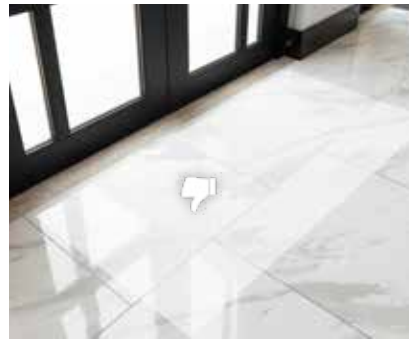
Now you see it! Typical "clear" anti-slip