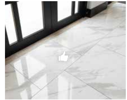
Now you don't! JESSUP SafetyTrack® 3307