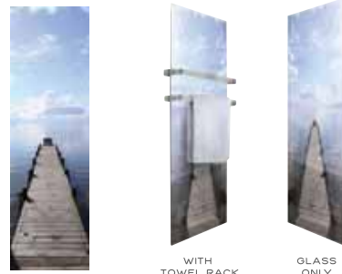
WITH TOWEL RACK GLASS ONLY