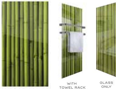
WITH TOWEL RACK GLASS ONLY