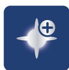
Up to 5,000 K

For fatigue-free and comfortable driving compared to standard halogen lamps