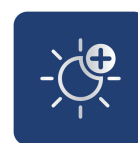
Up to 50% more light

High contrast and most stylish look on the road