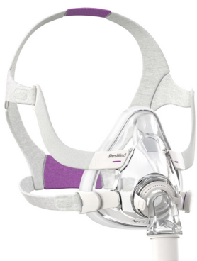
AirFit F20 for Her Designed specifically for women.

Quick-release elbow makes it simple to disconnect from the tubing without removing the mask.