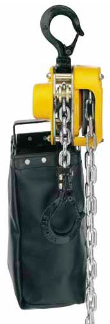
Option: Chain container