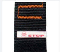
Activated fall indicator