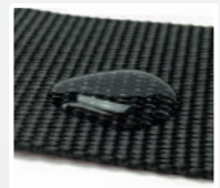
Water repellent webbing