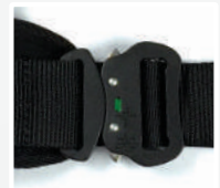
Automatic aluminum buc- kles with locking indicator