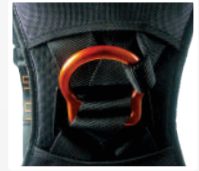
Orange coated back D ring

Padded leg straps with adjustment through automatic buckles