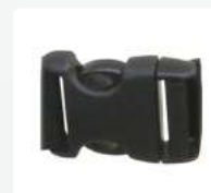
Quick fastening chest strap