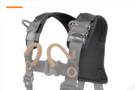
REMOVABLE BACK PAD WITH BREATHABLE 3D FABRIC