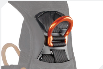
BACK FALL ARREST ATTACHMENT POINT WITH ALUMINUM D RING