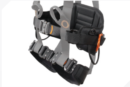
LARGE LEGS AND POSITIONING BELT WITH BREATHABLE 3D FABRIC