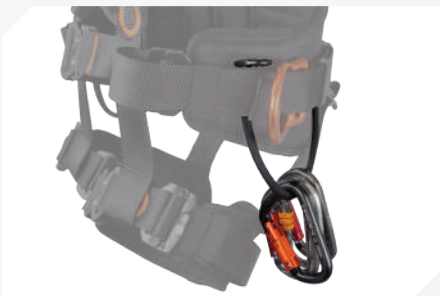
TOOL HOLDERS (X2) + LARGE TEXTILE STRINGS FOR TOOL HOLDING (X3)