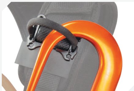
REMOVABLE LANYARD HOLDER (X2)