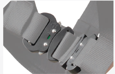
AUTOMATIC ALUMINUM BUCKLES WITH LOCKING INDICATOR