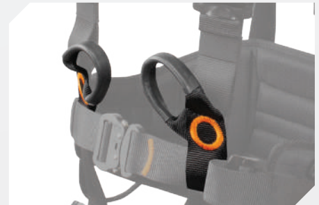
VENTRAL SUSPENSION ATTACHMENT POINTS BY WEBBING LOOPS TO LINK