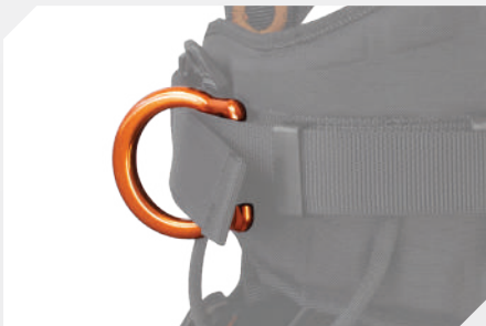
LATERAL ATTACHMENT POINTS WITH ALUMINUM PIVOTING D RING FOR WORK POSITIONING