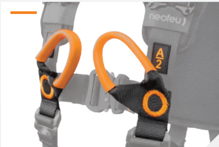
FRONT FALL ARREST ATTACHMENT POINT WITH WEBBING LOOPS TO LINK