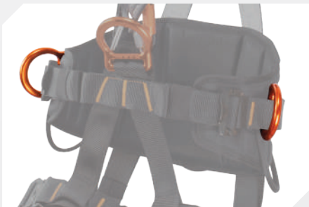
LATERAL ATTACHMENT POINTS WITH ALUMINUM D RING FOR WORK POSITIONING