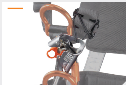
INCLUDED ASCENDER ADJUSTER REF. NUS131A + OPTIONAL VENTRAL ASCENDER REF. NBLOCK