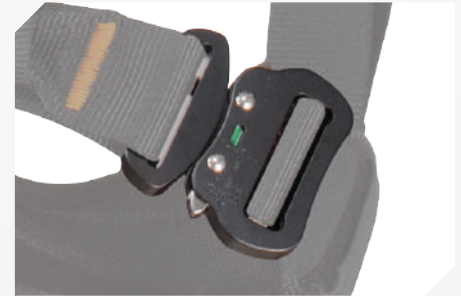
AUTOMATIC ALUMINUM BUCKLES WITH LOCKING INDICATOR