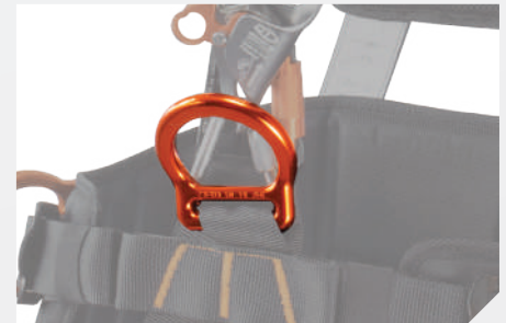
VENTRAL SUSPENSION ATTACHMENT POINT BY ALUMINUM D RING