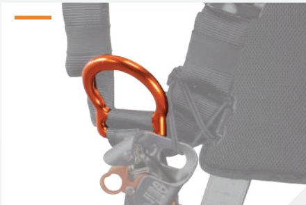
FRONT FALL ARREST ATTACHMENT POINT WITH ALUMINUM D RING