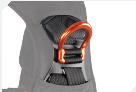
BACK FALL ARREST ATTACHMENT POINT WITH ALUMINUM D RING