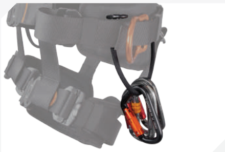
TOOL HOLDERS (X2) + LARGE TEXTILE STRINGS FOR TOOL HOLDING (X3)