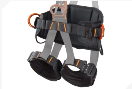
LARGE LEGS AND POSITIONING BELT WITH BREATHABLE 3D FABRIC