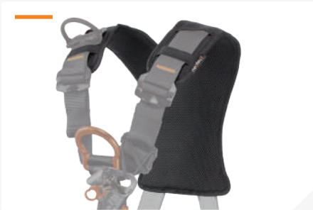
BACK PAD WITH BREATHABLE 3D FABRIC