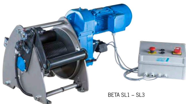
BETA SL1 – SL3