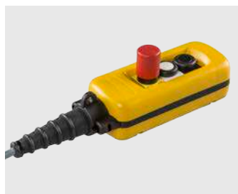
Option: control pendant