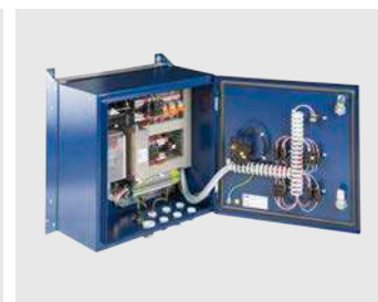
Option: frequency converter