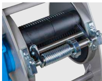
Option: pressure roller

Delivery time for version frequency converter approx. 25 days