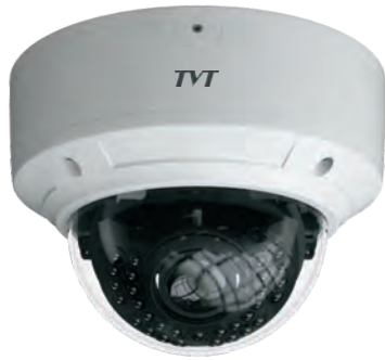
Motorised AF 3.3 ~ 12 mm @F1.4, angle of view : 80°~38°