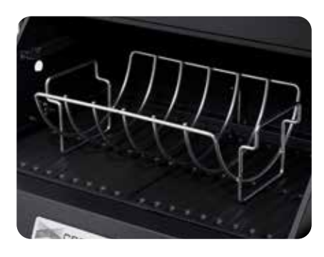
TCEAC-005 Roasting rack