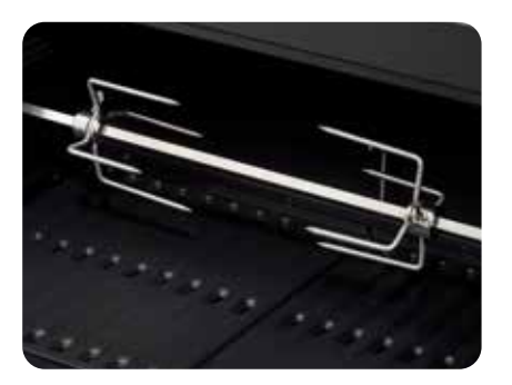
TCEAC-004 Rotisserie kit