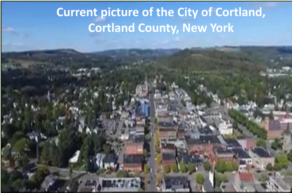
Current picture of the City of Cortland, Cortland County, New York

City of Cortland, NY, Year 2016 with majority of the land having returned to trees.