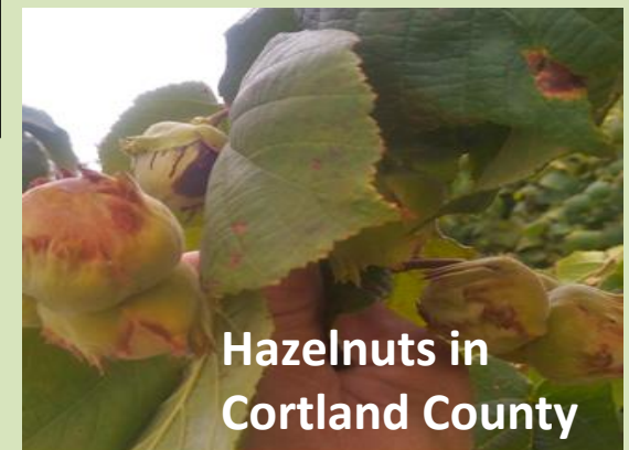
Hazelnuts in Cortland County

We can see that nature, if given the opportunity, will repopulate the Northeast with trees.