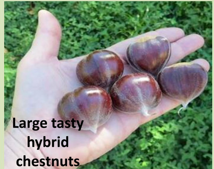
Large tasty hybrid chestnuts

Much of the hillsides were allowed to go fallow and are returning to forest.