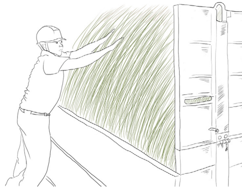
Finally: Drying & Storing