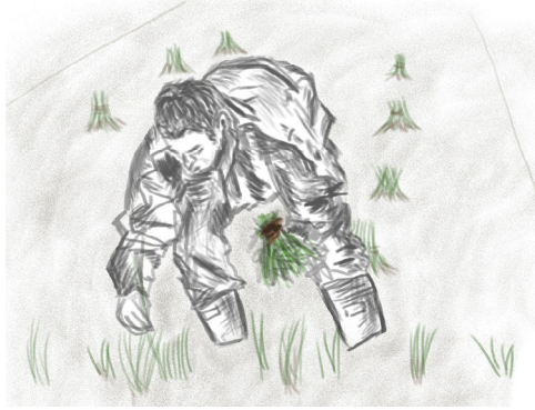
Nov.~ Dec.: Seedling