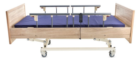
Adjustable Bed Height

Scan QR code for more information on product and warranty