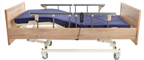
Lower Body Elevation