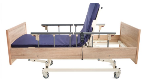
Upper Body Elevation