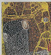
Untitled, acrylic on canvas, 2018