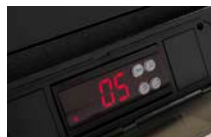
0 – 10 degrees electronic temperature control