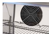
Recirculating internal fan