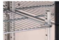
Chrome adjustable shelves