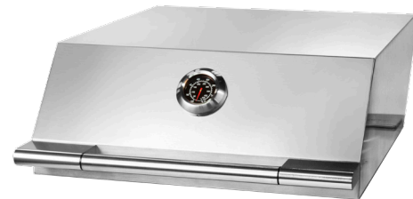
Pictured: ABBQM3 hooded lid