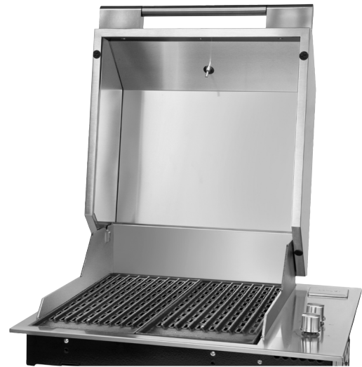
Pictured with ABBQM3 hooded lid