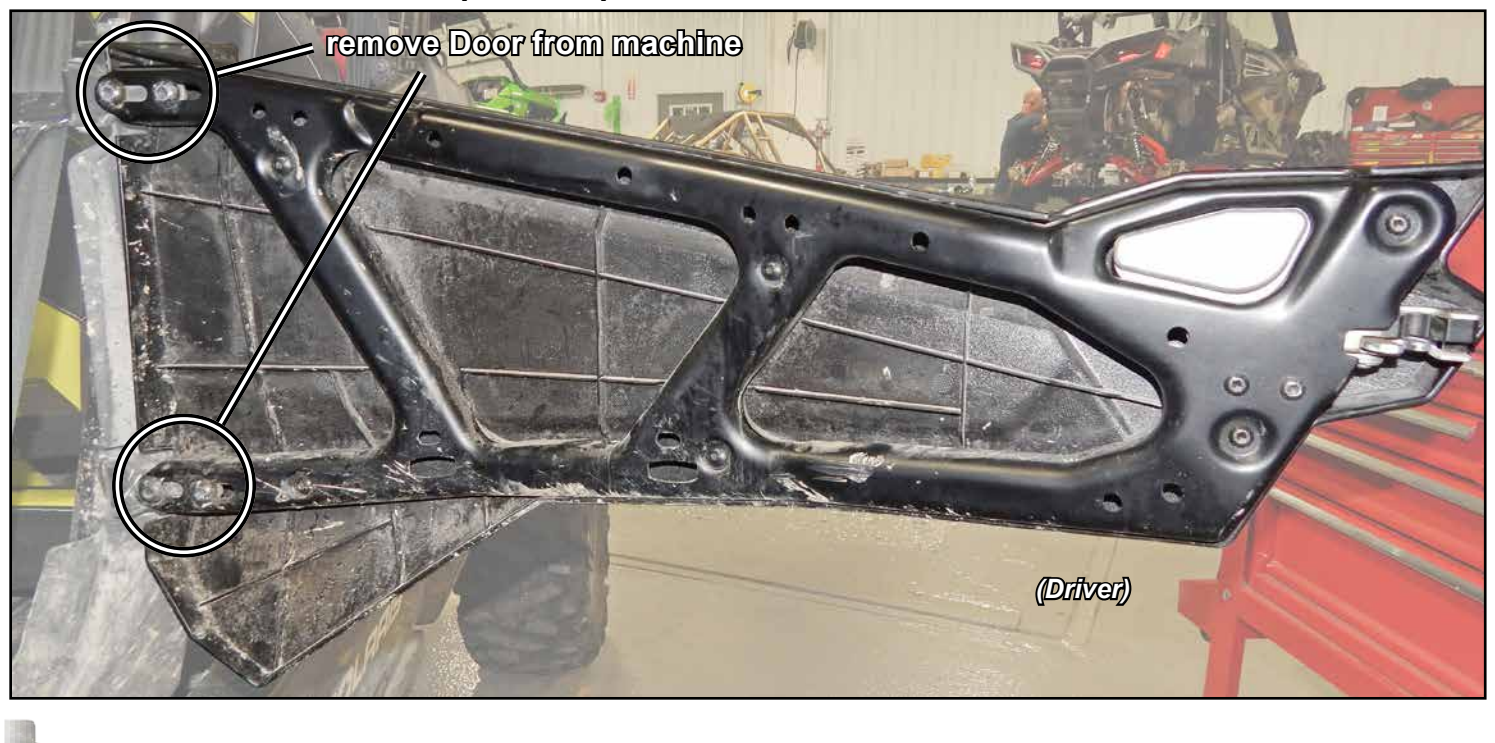
Keep all components removed from machine