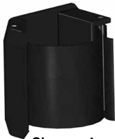
Clamp x 4