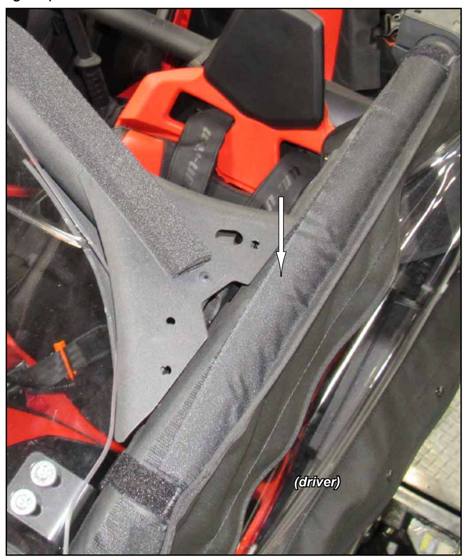
repeat all steps for opposite side installation