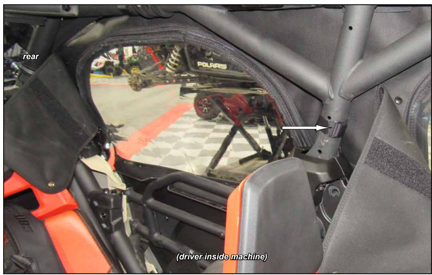
- Align Soft Cab to machine and cinch Straps tight.