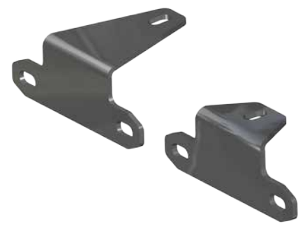
RWS-H-TAL4 Upper Bracket