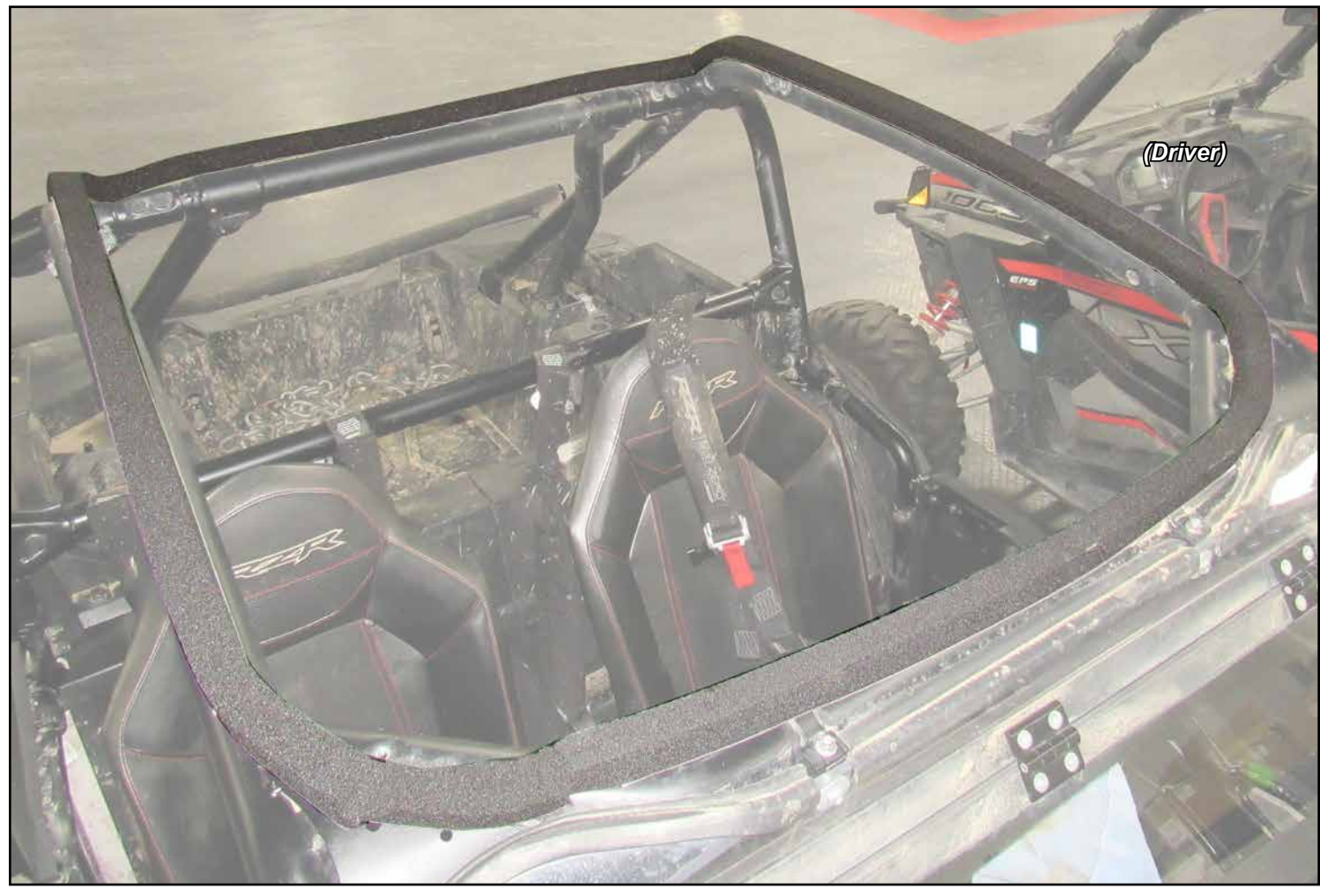
- Install Seal to Cage in locations shown.