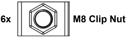
6x M8 Clip Nut