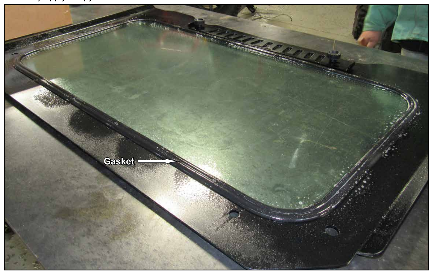
- unlock Gasket by inserting tool and running around entire Gasket