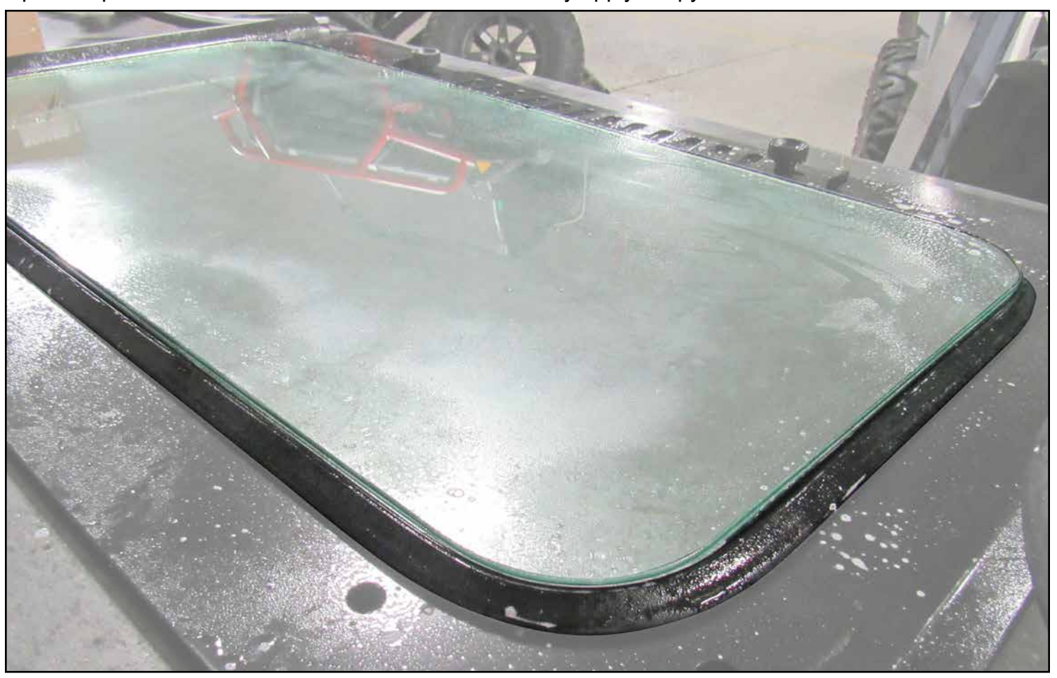
- lock Windshield into Gasket by inserting tool and running around entire Gasket

- place replacement Windshield onto Gasket and liberally apply soapy water