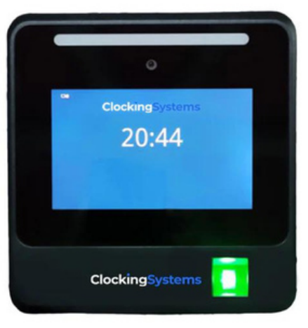
13.5cm x 14.5cm x 3cm

0113 258 7856 customerservice@timepg.com www.clockingsystems.co.uk