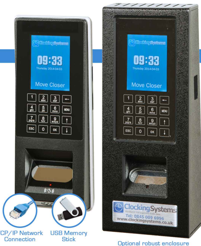
Optional robust enclosure