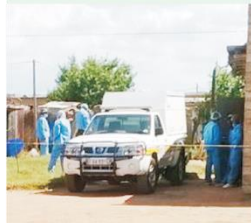
Government mortuary van awaiting the remains that were found.