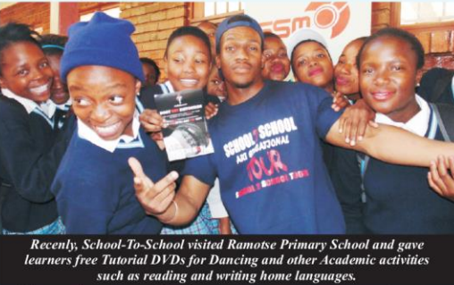
Recently, School-To-School visited Ramotse Primary School and gave learners free Tutorial DVDs for Dancing and other Academic activities such as reading and writing home languages.