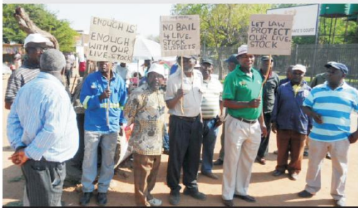
Members of Moretele Odi Farmers Forum display placards opposing the bail application of the livestock suspects.