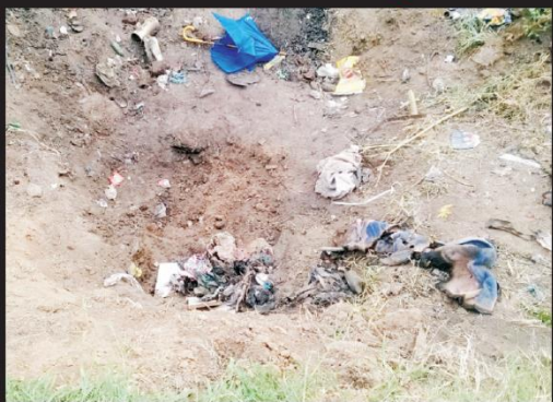
The shallow grave where the remains of Molefe were found by the forensics. See page 3.