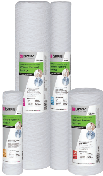
WD SERIES PERFORMANCE DATA