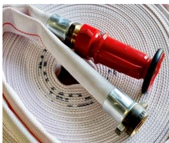
Crimped Coupling & Nozzle

All Fire Hose Kits come in standard 20m or 30m lengths with secure factory-fitted crimped BSP fittings plus shut off nozzle. The coupling connects directly to your fire pump making it ideal for quick deployment in times of an emergency during and outside fire season.