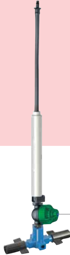
Super LPD (medium pressure)