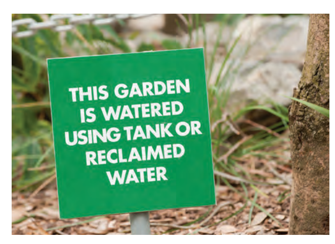
TIP - Provide signage for your garden.