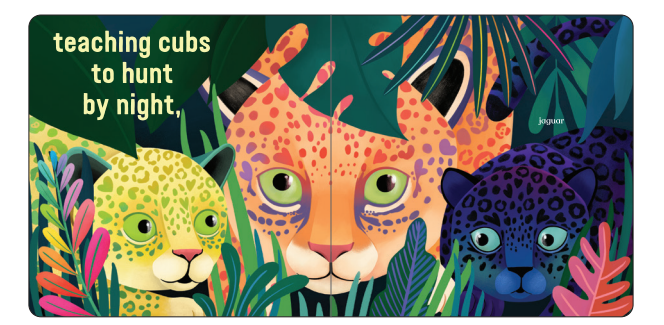
Jaguars: Jaguar moms stay with their cubs for about two years in order to protect them and teach them how to hunt for food on their own.

Vampire Bats: Female bats share food with close female friends.