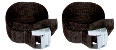
9' BOTTOM BLOCK CINCH STRAPS