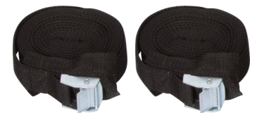
15' TOP BLOCK CINCH STRAPS