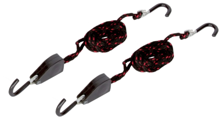
BOW & STERN TIE DOWNS