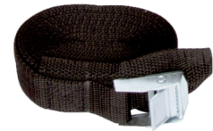
15' CINCH STRAPS