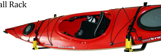
Deluxe Wall Rack

Visit www.SuspENZ.com for additional storage and transportation solutions.