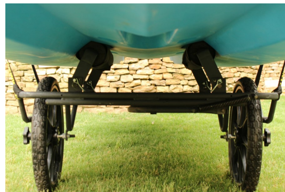
“Big Yak” Bunker Bars angled at 12” spread

Orient the “Big Yak” Bunker Bars so that the Stamped Dot is next to each wheel