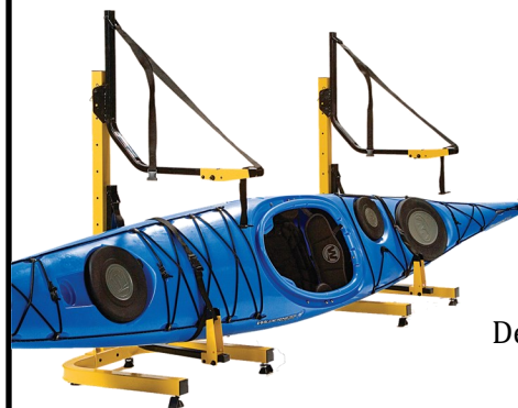
Deluxe 2-Boat Rack

FOR TECHNICAL ASSISTANCE OR REPLACEMENT PARTS: CALL 866.787.7369